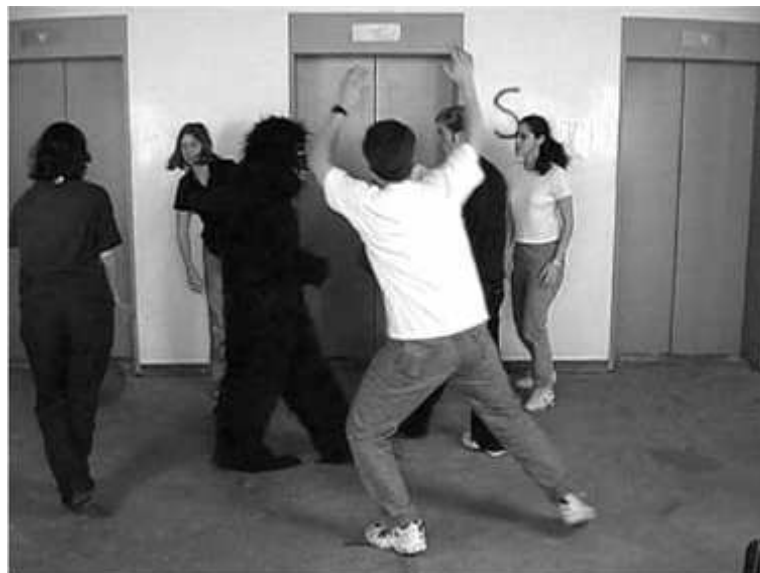
Figure 3. Gorilla walking through basketball passing experiment (from Simons & Chabris, 1999).

To demonstrate the significance of ecological information one only needs to look at what is called “change blindness.” In a number of studies change blindness has been demonstrated when very large and significant visual events can occur and be totally missed by an active viewer. For example, participants asked to watch a group of people and count the number of times the ball was caught by person wearing a certain color shirts, missed a woman walking through the scene carrying an umbrella (Neisser, 1975; Neisser, 1979) or a man walking through the scene dressed in a gorilla suit (see Figure 1 below) over half of the time (Simons & Chabris, 1999). This phenomenon has also been labeled inattention blindness (Simons & Ambinder, 2005).